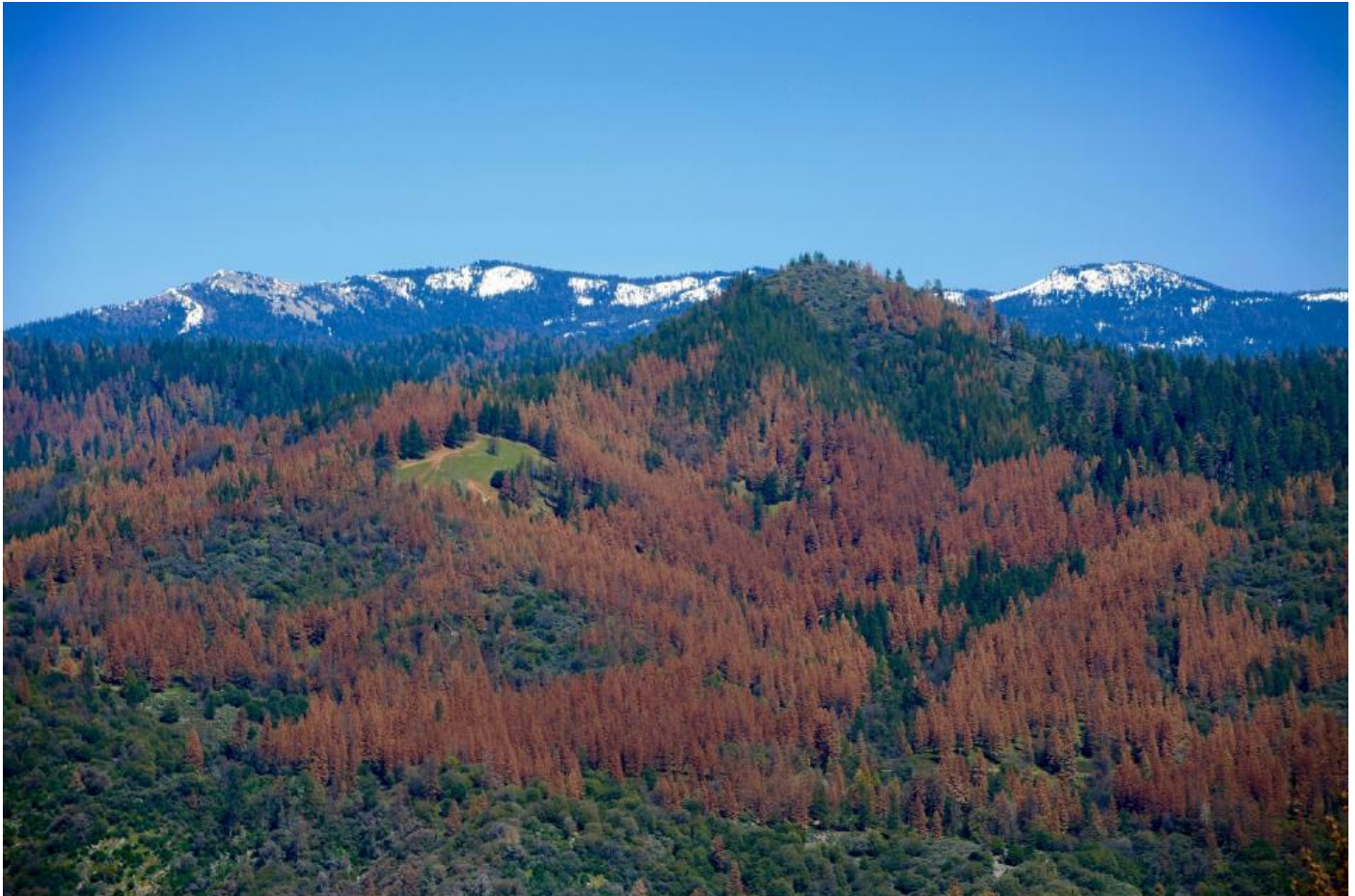
Dead trees in the Sierra National Forest in April 2016.

Why do some trees die in a drought and others don't? And how can we predict where trees are most likely to die in future droughts?